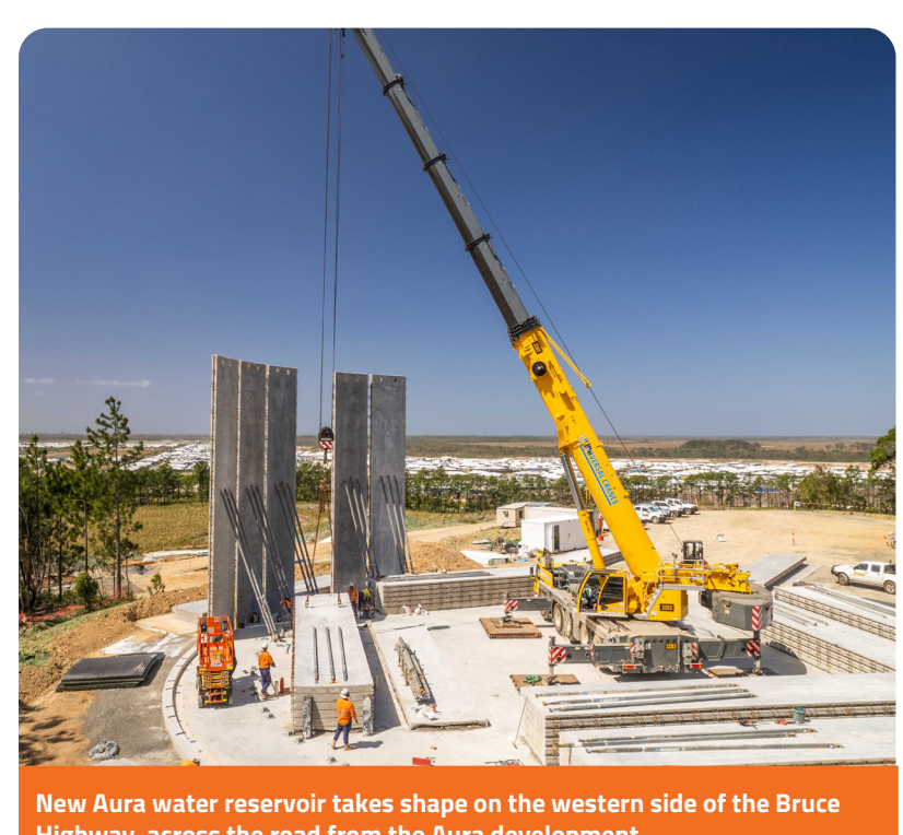
Highway, across the road from the Aura development.

These impressive structures are both on track for completion by early 2025.