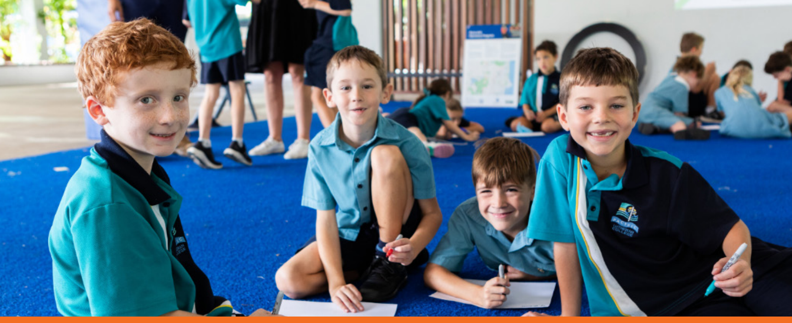
Pacific Lutheran College Year 2 students took part in an Aura and Harmony Program information and artwork session with our project engineers. Can you guess the most used word by students on the day? You guessed it... poo!