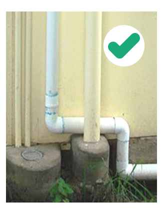
ORG connected to sewer network