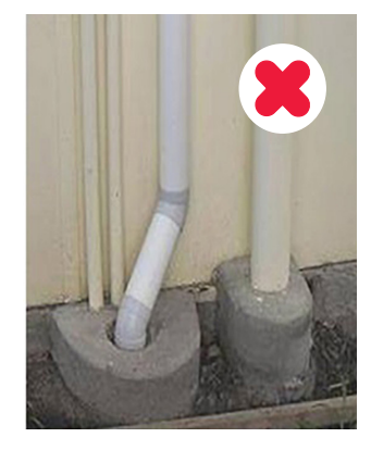
ORG connected to stormwater system